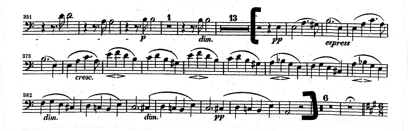
Mozart - Overture - Marriage of Figaro: mm. 101-123 & mm. 139-171